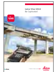
Leica Viva GS14