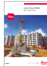
Leica Nova MS60