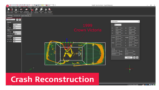
Determine the approach and departure angles in a collision or calculate the crush energy and EBS.

Analyse impact patterns to define the area of origin, and produce a 2D or 3D visualisation.