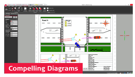
Customise your diagram with various views to highlight critical areas of the scene.