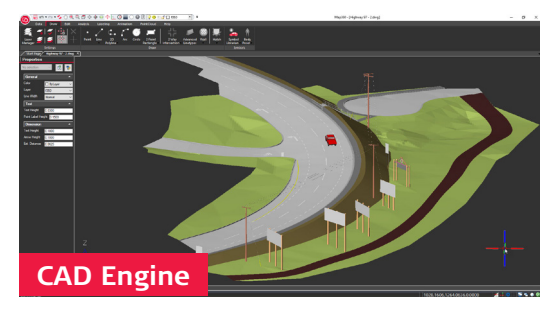
Intuitive workflows and tools specific for Public Safety while maintaining a solid CAD foundation.

Accurately reconstruct bullet trajectories from measured or scanned trajectory rods.